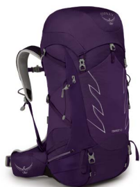
♀ TEMPEST 40