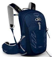
♂ TALON 22 EF ↗