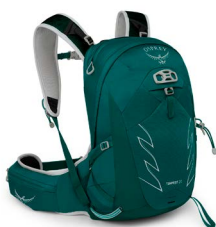
♀ TEMPEST 20 EF ↗